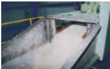
The LO-CAT II system converts H 2 S to a harmless sulfur cake.

Only the LO-CAT II process offers geothermal steam producers a desulfurization process with high efficiency, economical operating costs, and easy operations using an environmentally safe scrubbing solution.